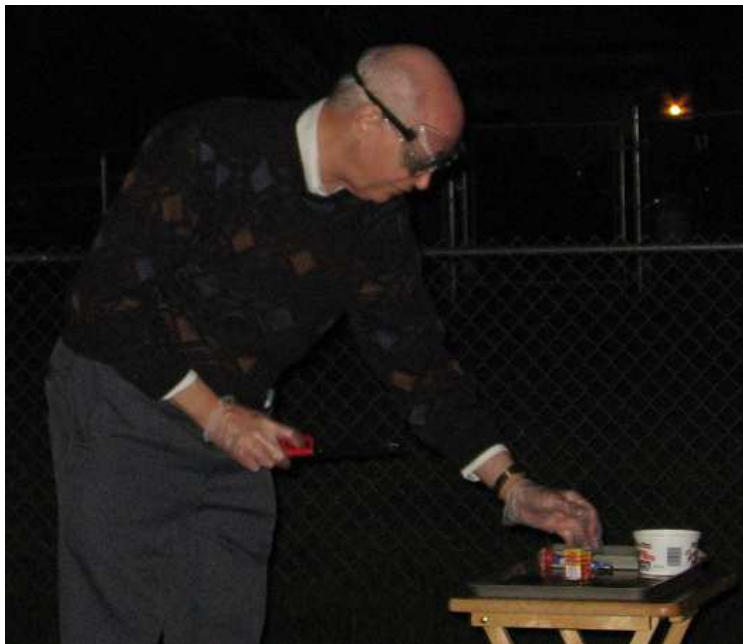
Willing to share the wonders of science, and bring goggles for everyone!