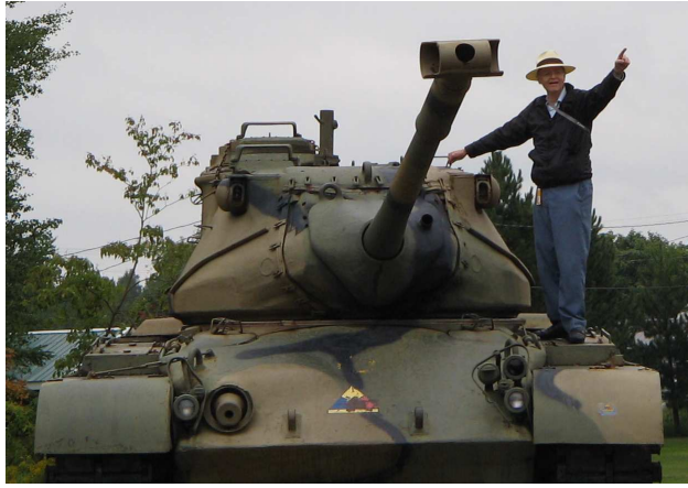
Knowing what was important in life, you led the charge!