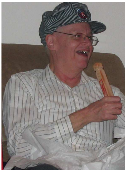
Always delighted by simple joys, it didn't take much to get you excited!