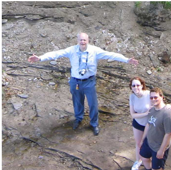
You embraced your friends and found happiness in each moment!