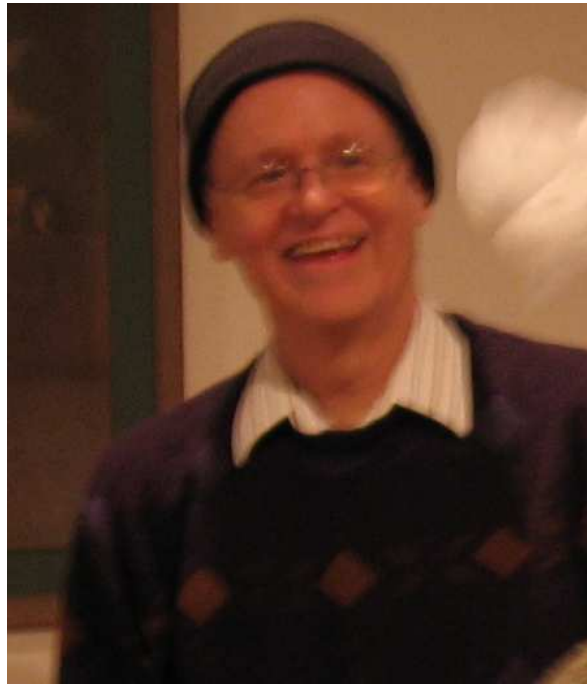
Always ready with that funny and zany comment!