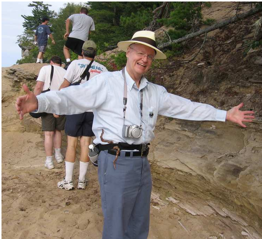
You would want all of us to embrace life as much as you did – and you did all the time!