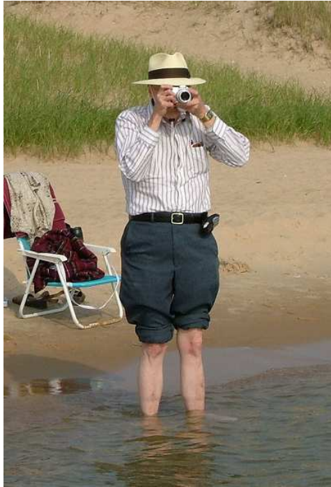
Sometimes caught with your pants up!