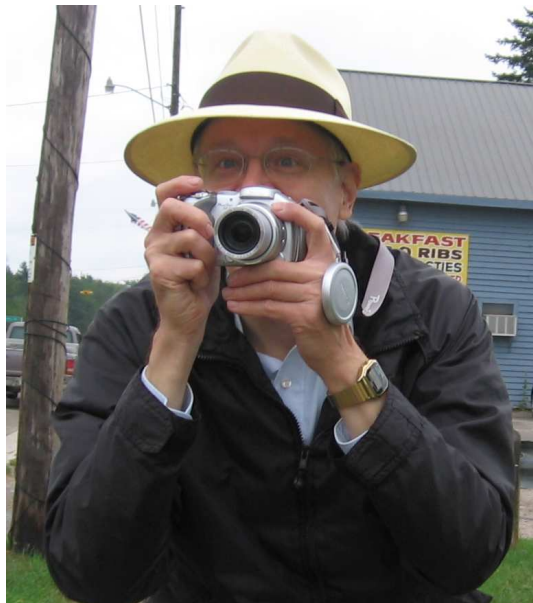
And always capturing the right moments!