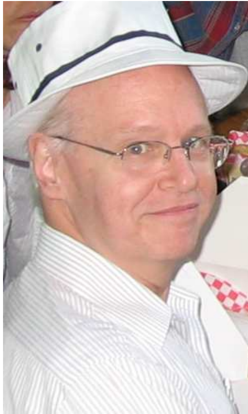
We won't forget that you loved us too!