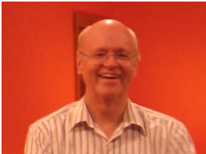
What was most important in life was to enjoy yourself always, and you did it!