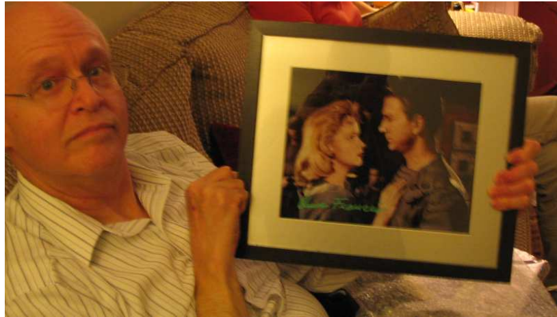
A Renaissance man of many values and interests!